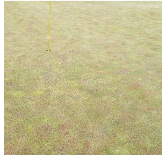
The grass is still dormant or semi-dormant throughout much of the Mid-Atlantic Region. The calendar says spring, but colder than normal temperatures are still delaying turfgrass development.

If you need any more evidence that it has been very cold this spring, blue crab season opened on the Chesapeake Bay on April 1. However, there are no crabs! It is too cold for them to emerge from the mud. Again, be patient.